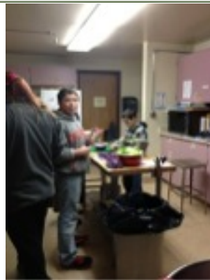
Students preparing the salad for the Board of Education meeting on October 21st.