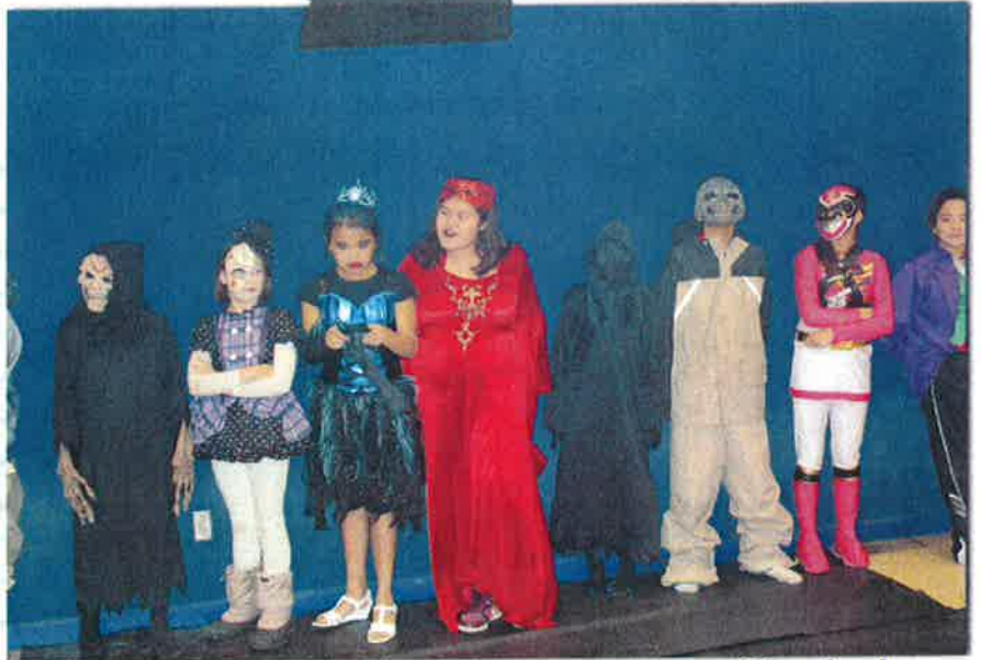
Great times at the Mentasta Halloween Carnival

In Science we are learning about the water cycle. Students will create a poster, iMovie, or song to illustrate the water cycle!