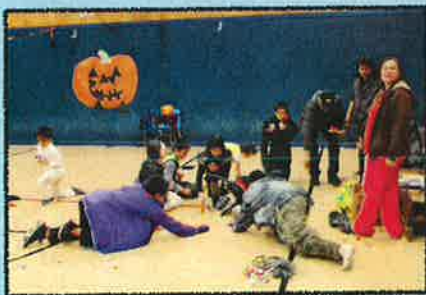
STUDENTS SCRAMBLE TO GET CANDY THAT WAS PASSED OUT AT THE END OF THE CARNIVAL - THE MAIN SNACK FOR PARENTS AND STUDENT'S WAS FRUIT'S AND VEGETABLES, THOUGH