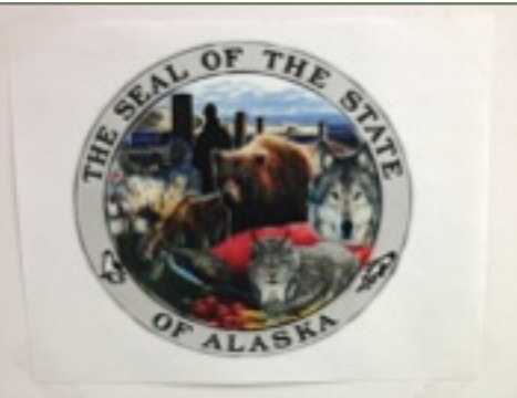
Above is a student rendition of the Seal of the State of Alaska Project. Students were tasked with creating an alternative seal that encompassed industries and cultural activities in Alaska. This student chose to focus on hunting, trapping, oil, fishing, and farming for their project.