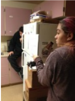
Behind the scenes of the cooking video filming process. In the picture, the director, the director, co-director and, slightly hidden, the videographer.