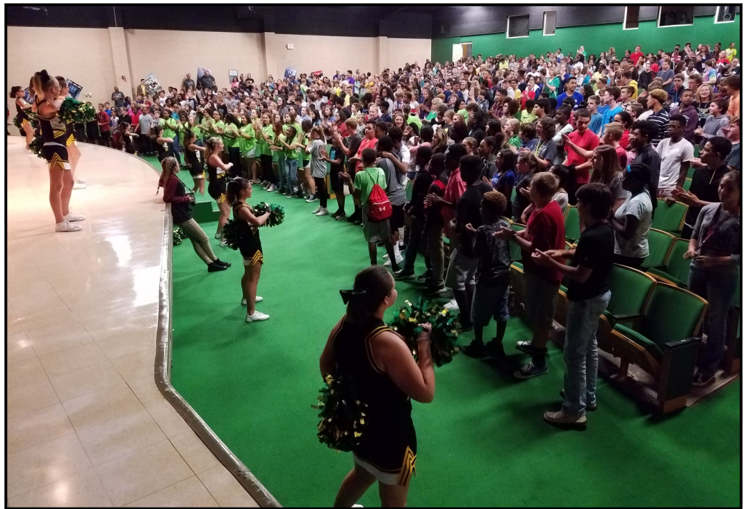
MMS students and faculty cheer on the fall athletic teams at our annual pep rally in September. The enthusiasm shown by the 8th graders at the pep rally brought the spirit stick back to their hallway for the school year.

Page 4 — Feature: "How to Pick a Great Book"