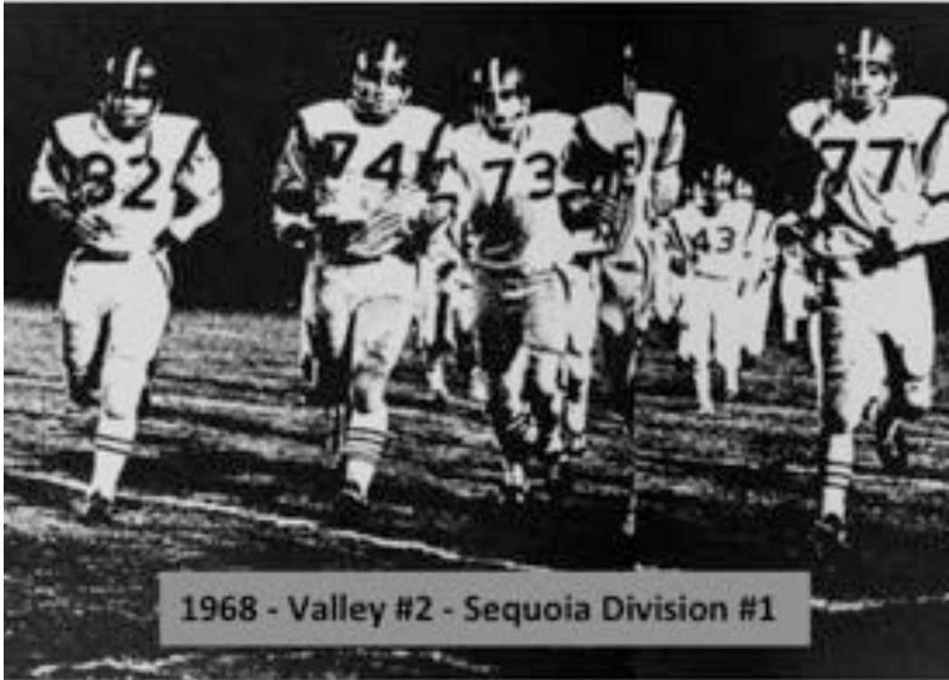
1968 - Valley #2 - Sequoia Division #1

Singer High Apaches 1 State Championship 7 Valley Championships 25 League Championships