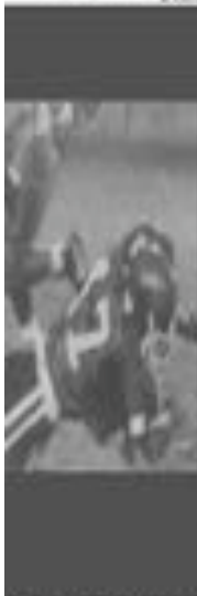
James Pineda - 1963 Most Kick-off Returns for Touchdown - Single Game 2 versus Selma