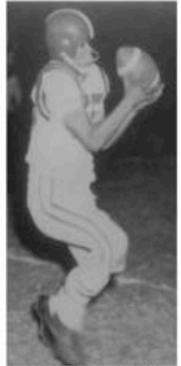
Kay Nishimura- 1960 #1 All-Time Longest Touchdown 99 yds (versus Selma)