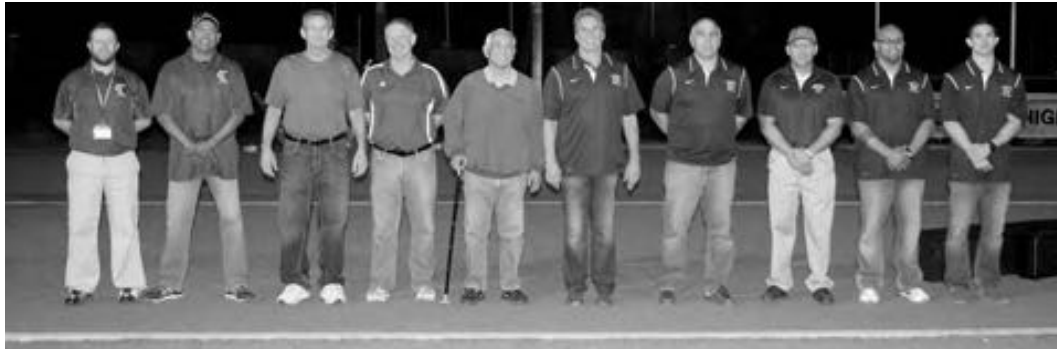
Honorary Team Captains