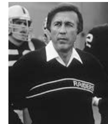
Tom Flores, Head Coach (NFL) Oakland Raiders 1979-87 (NFL) - Super Bowl Championships in 1980 & 1983 Seattle Seahawks (NFL) 1992-94