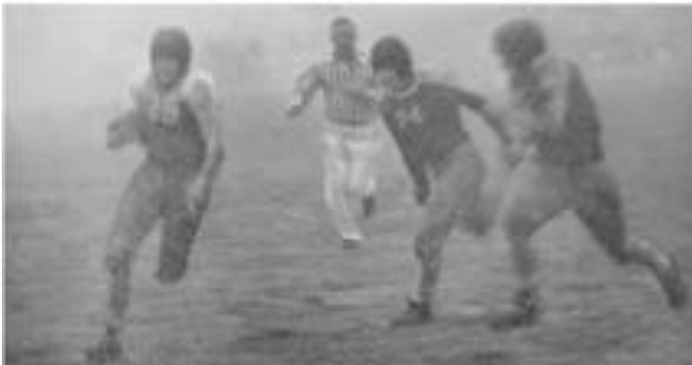
1944 - League Champion & 1 st of only 2 Undefeated Seasons