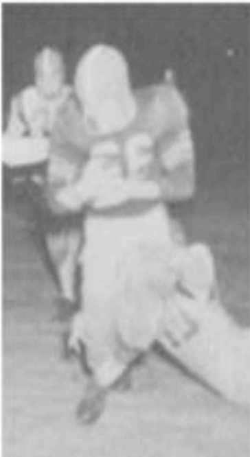
Ernie Reese - 1956 1 st 1000 yd Single Season 1036 yds (n-a/rush & 103.6/game)