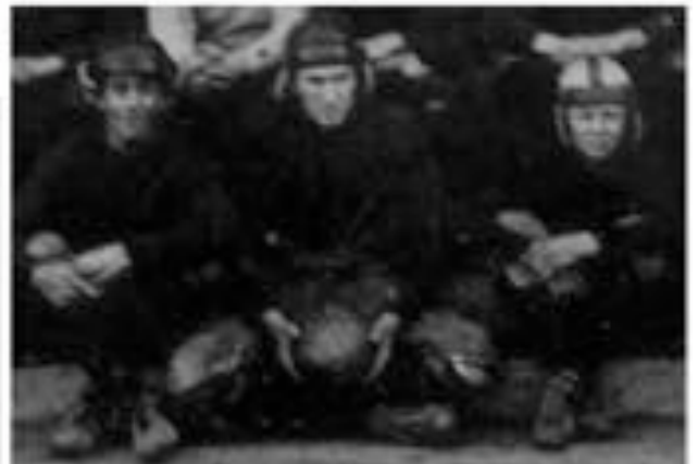
1924 - League Champion & 1 st 5 Win Season