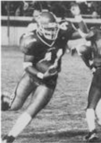
2001 - 1 st Valley Champion in New Millenium