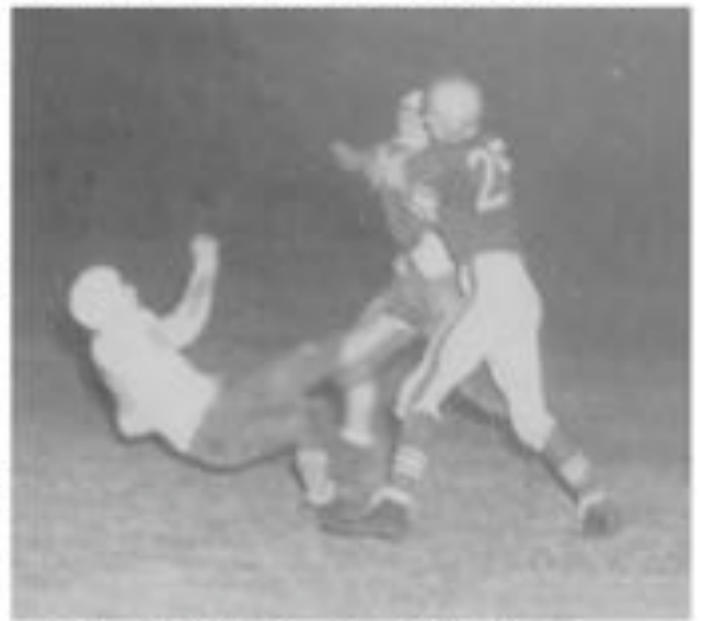
1951 - 1 st Valley Champion & 1 st 8 Win Season