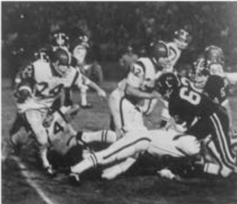
1968 - Valley Champion & 1 st 11 Win Season