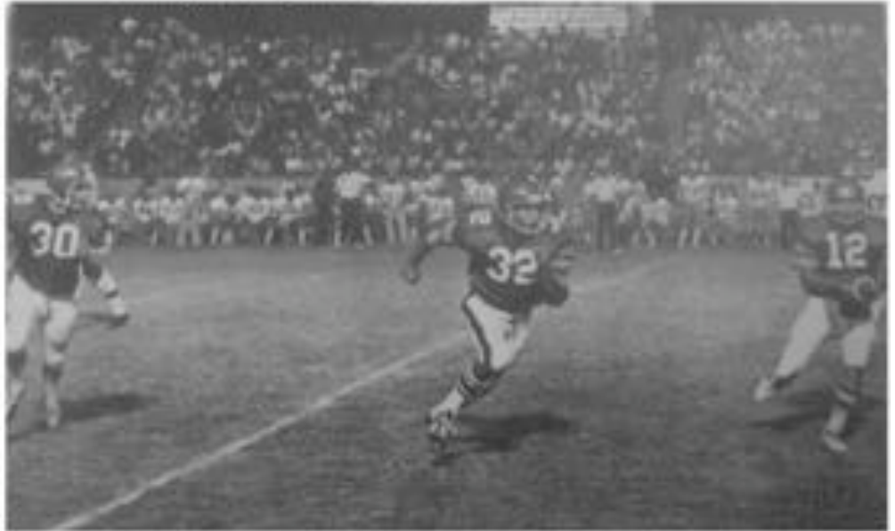
1976 - Valley Champion, Only State #1, Only Valley #1 & Only 12 Win Season