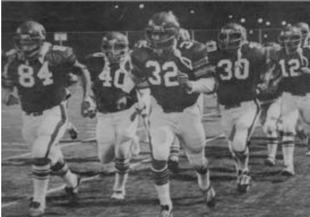
1976 - State #1 - Valley #1 - Yosemite Division #1

Singer High Apaches 1 State Championship 7 Valley Championships 25 League Championships