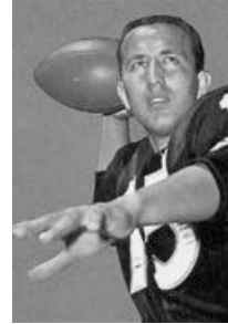
Tom Flores Oakland Raiders 1960-66 (AFL) Buffalo Bills 1967-69 (AFL) Kansas City Chiefs 1969 (AFL)