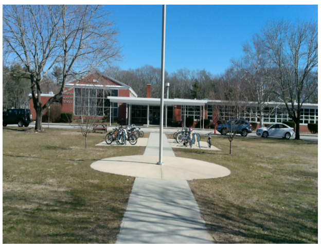
Hampden Meadows ES