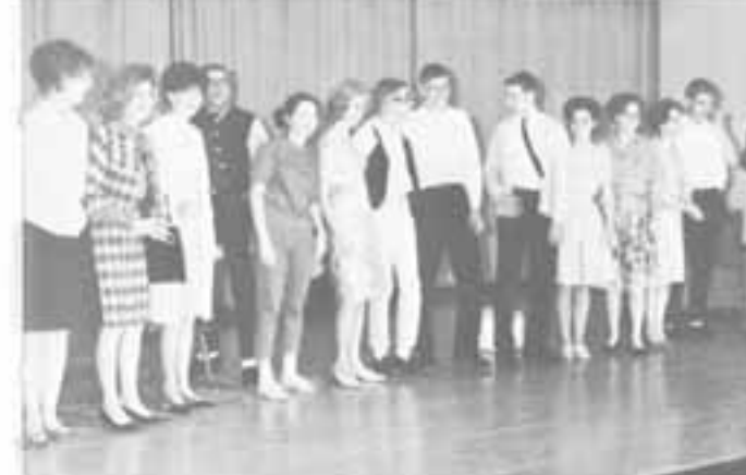
Meet the cast