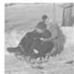
Which is the little Child?