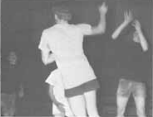
Boys! Not here!