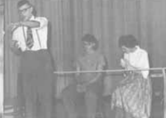
Don't be bashful