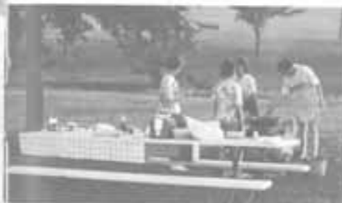
Cook of the year.