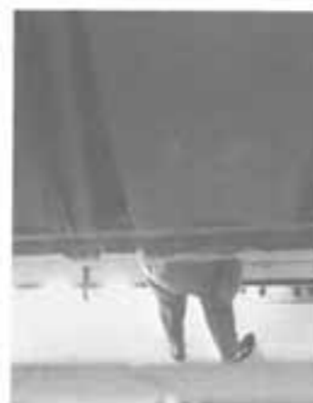
How does this work?