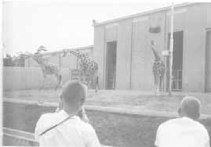
Capturing the zoo on camera