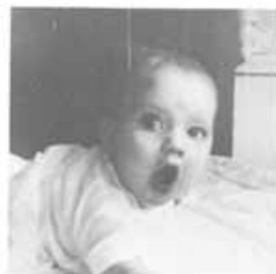
Our Trojan Editor?!