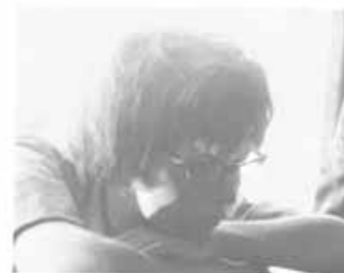
What's the problem?