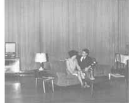
"You have a fabulous smile."