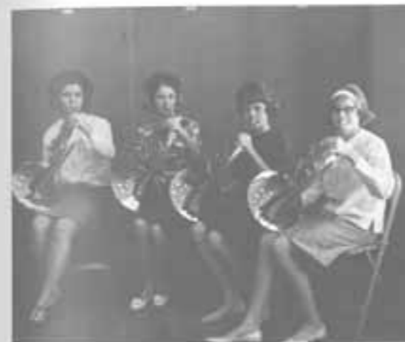
FRENCH HORN QUARTET