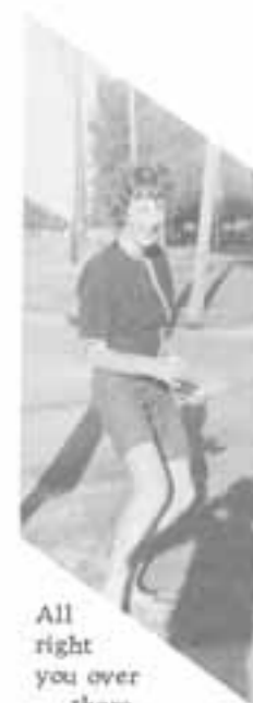
All right you over there