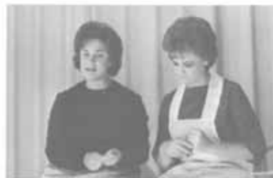
Mrs. Gibbs and Mrs. Webb.