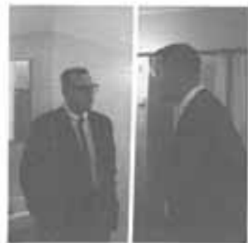
What shall we do now?