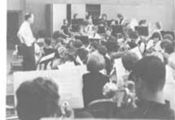
Let's have some action.