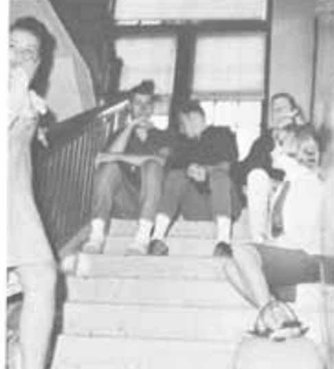
Who wants classes!