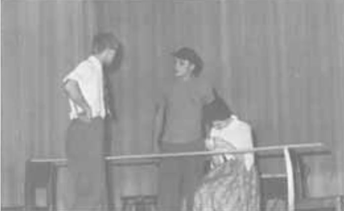
Scene at the drugstore.