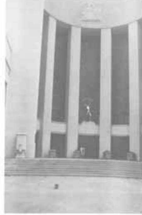
Texas Hall of State