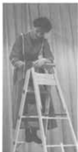
What a place to study!