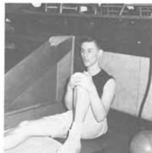
Star bench warmer.