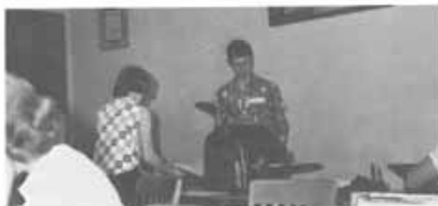
Getting the last Oracle ready!

The annual staff has tried to make this yearbook enjoyable and worthwhile to you, the students of Hillsboro High School. We hope it will create a lifetime of memories for you.