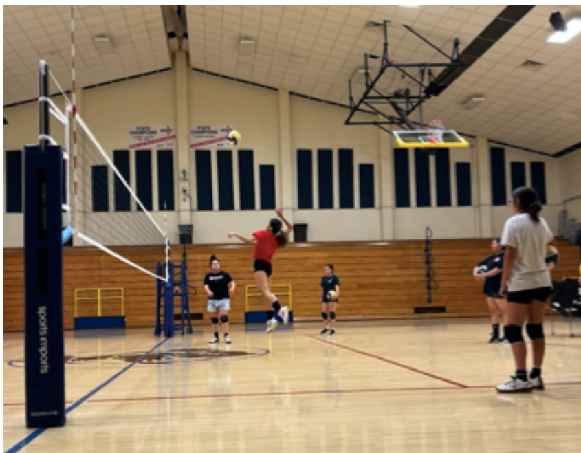
Volleyball practice in the Jicarita Gym.

The High School Roster for the 2022 Cross Country season is: