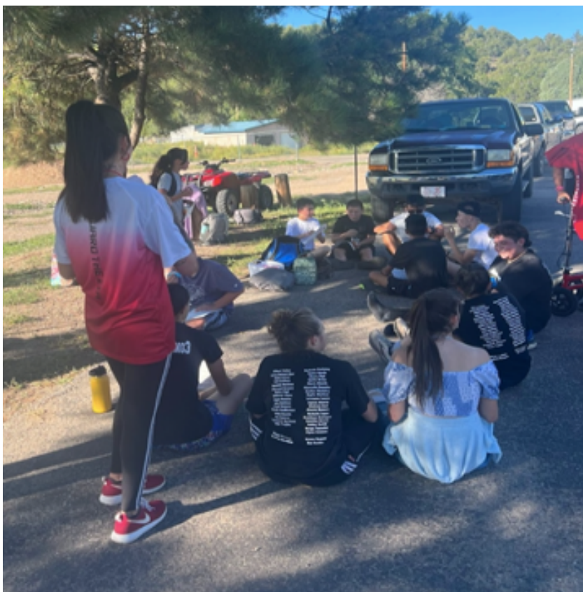
Cross Country team huddles to end practice.