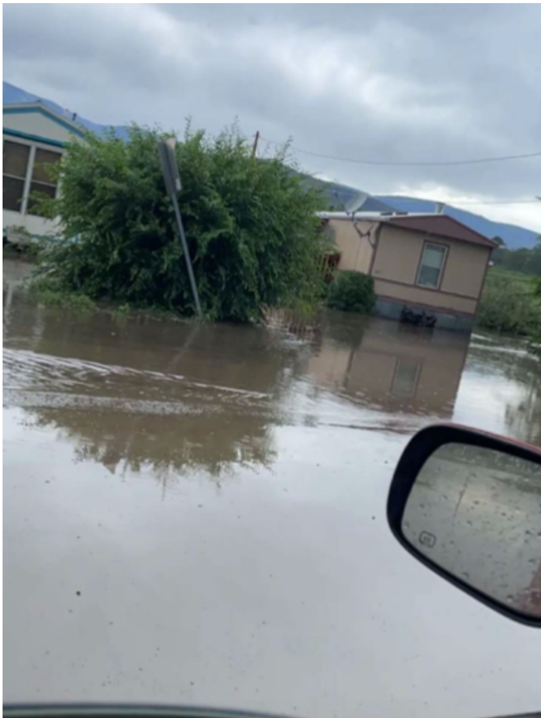
Flooding in Mora county after severe rainfall

MacAuley sets a great example for the kids in Mora and is doing a great job. After all these natural disasters impacting Mora and surrounding communities, many are hopeful that northern New Mexico will get a break from these challenges and tragedies.