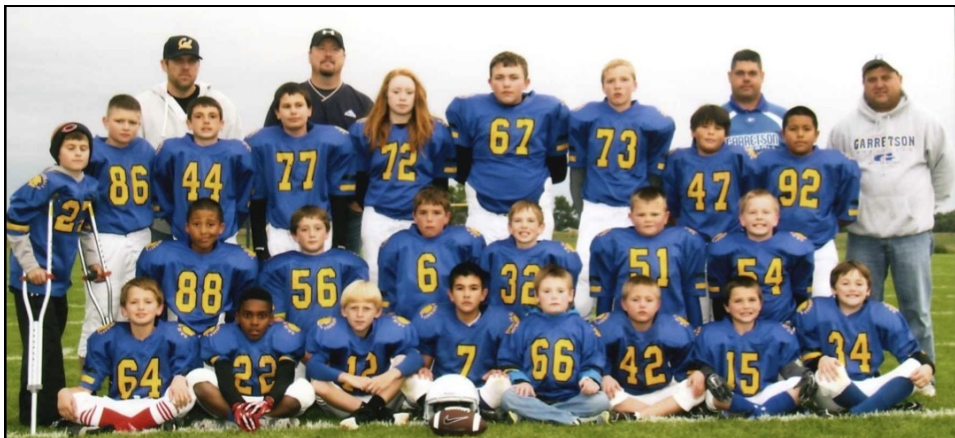
Many of the Blue Dragon seniors have been playing together for years, getting an early start in tackle football, playing in the South Dakota Junior Football program. Also pictured are this year's current juniors.