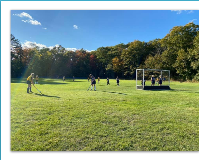
Middle School Field Hockey Inter-Squad Scrimmage.