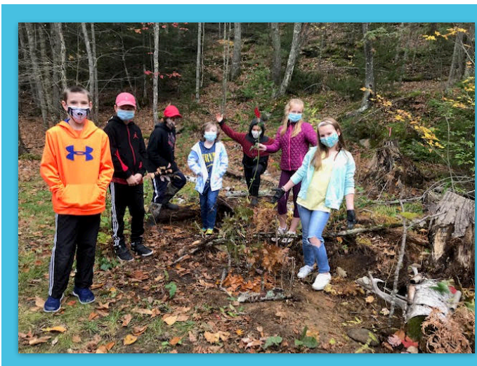
Sixth Grade class creating an Andy Goldsworthy nature sculpture.