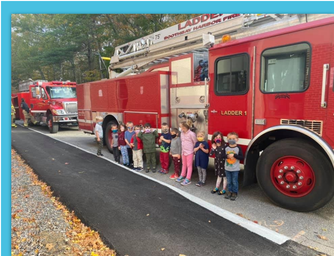
Fire Safety visit from both Boothbay and Boothbay Harbor Fire Departments.