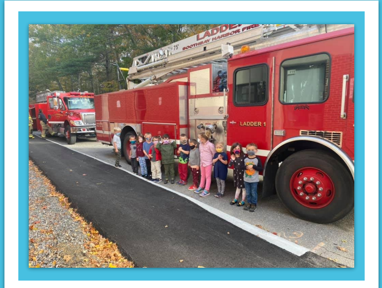
Fire Safety visit from both Boothbay and Boothbay Harbor Fire Departments.