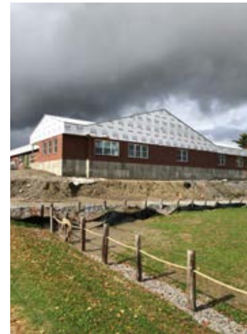
Our new music and art addition is nearing completion!