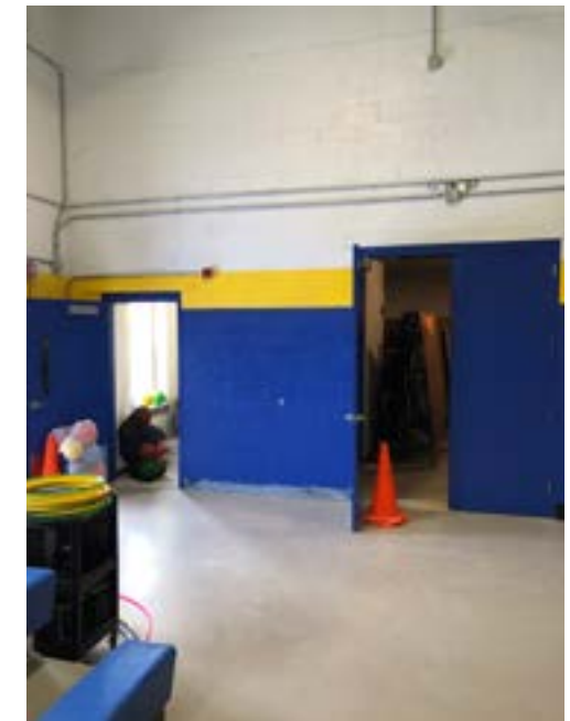
The athletic office and storage room.