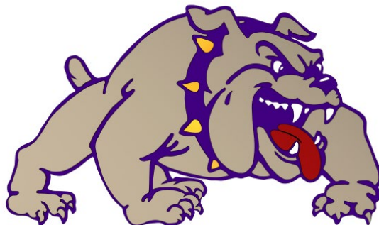
McAllen High School Bulldogs