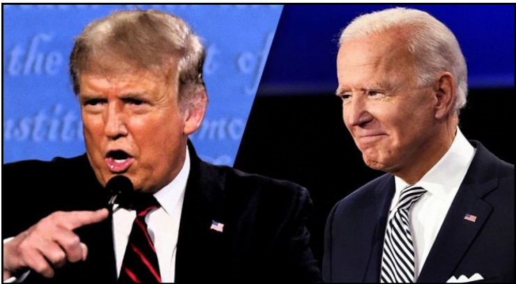
President Donald Trump and Vice President Joe Biden are set to debate again (hopefully more civilized) Thursday, October 15