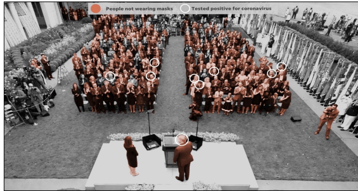
USA Today reports those who tested positive for COVID-19 at the Rose Garden announcement of the Supreme Court nominee. The photo also shows who was not wearing a mask at the event.

COUNTDOWN TO BREAK: 1 Day Next break is tomorrow, October 9 through 12 —staff in-service and Native American Day.