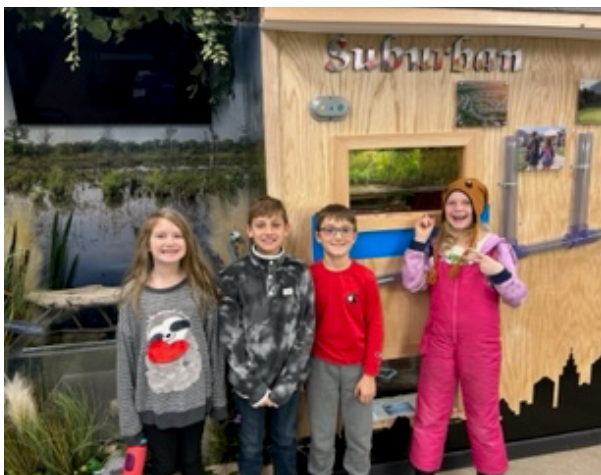
All smiles on our field trip!