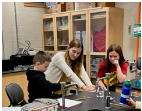
Students test for bacteria in the water