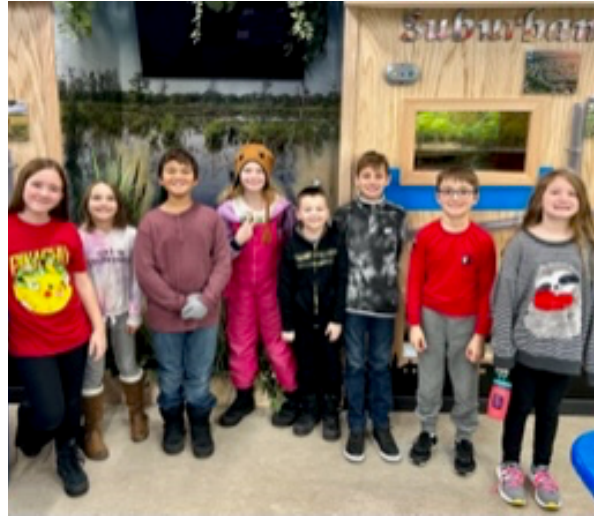
The class poses in front of the turtle exhibit!