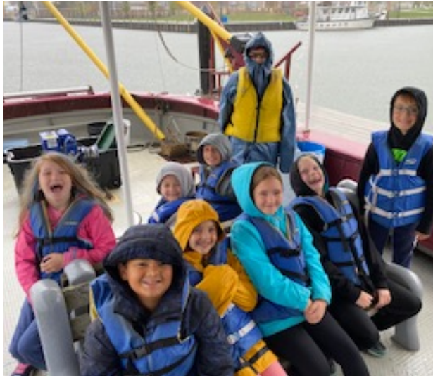
Students brave the cold waters of Presque Isle Bay!