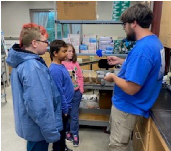
Students learn about water quality testing.