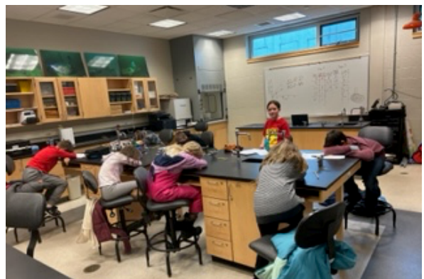
The students enjoy a friendly game over the lunch break.