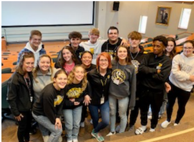
Iroquois students participated in Business Day at Behrend

On October 28, high school students participated in a day long event at Penn State Behrend. Students from Erie, Crawford and Allegheny County High Schools participated in mock business courses. Behrend Business Day is designed to help students gain an understanding of business basics by having them participate in a variety of activities. Mock business courses, for example, give teens an idea of what to expect when taking classes in a business major, such as accounting, finance and management information systems. These experiences may help them determine whether they would like to pursue these fields after high school. Participants also network with Behrend faculty members and learn about the various academic programs offered by Behrend. This event also included lunch at the Cafe and a campus tour. The students were engaged and had a great time!