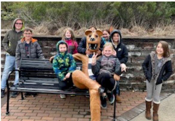
IES students pose with the famous Nittany Lion!