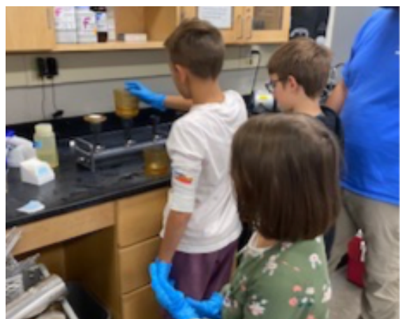
Camden tests for bacteria back in the lab.