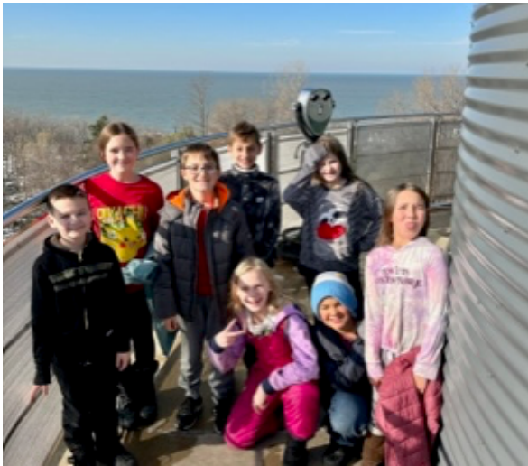
The students enjoy the beautiful view!