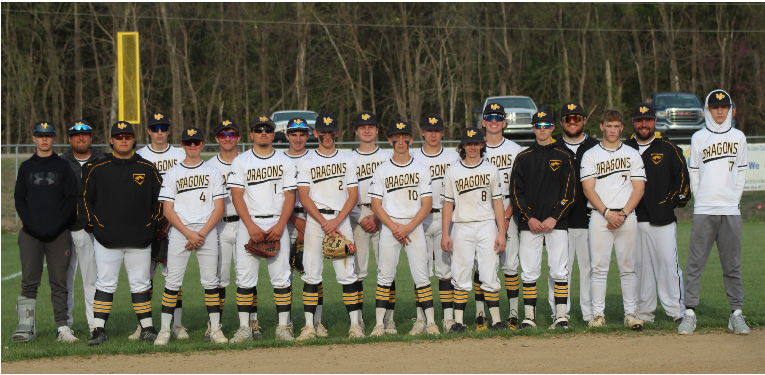
The Valley Falls High School Boys Baseball Team.

The baseball team has also had a great season. The Valley Falls boys baseball team ended their regular season 14-6. There were many key players on the team who helped drive them to win with their leadership on the field.