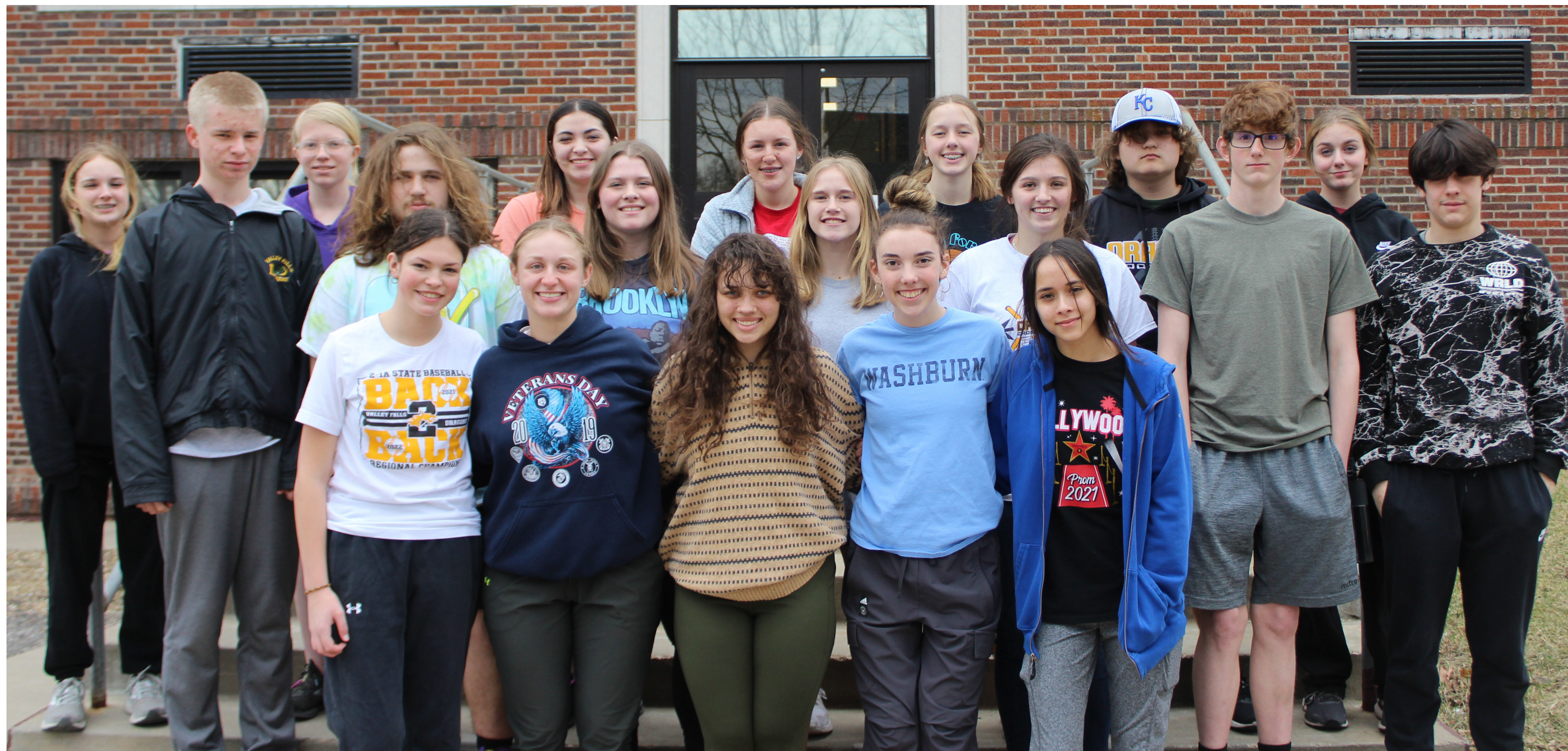
The Valley Falls High School Track and Field team takes a photo during the pre-season.