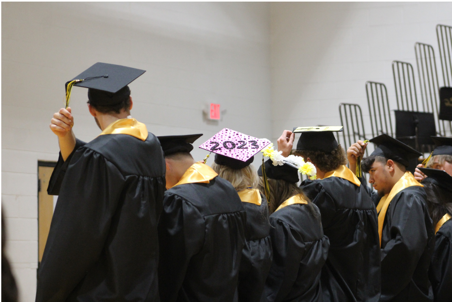
Valley Falls High School seniors move their tassels as the graduation ceremony came to a close.