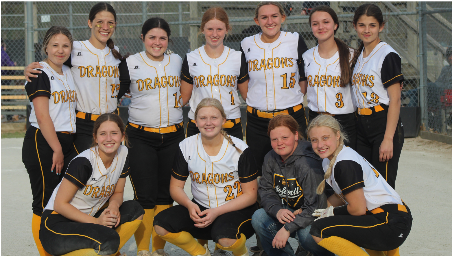
The Valley Falls High School Lady Dragon Softball team.

Both the softball and baseball teams won their first regional games on Tuesday, May 16th, despite some weather delays and complications. Both Dragon teams hope to win their second regionals game on May 17th and make it to the state tournament!