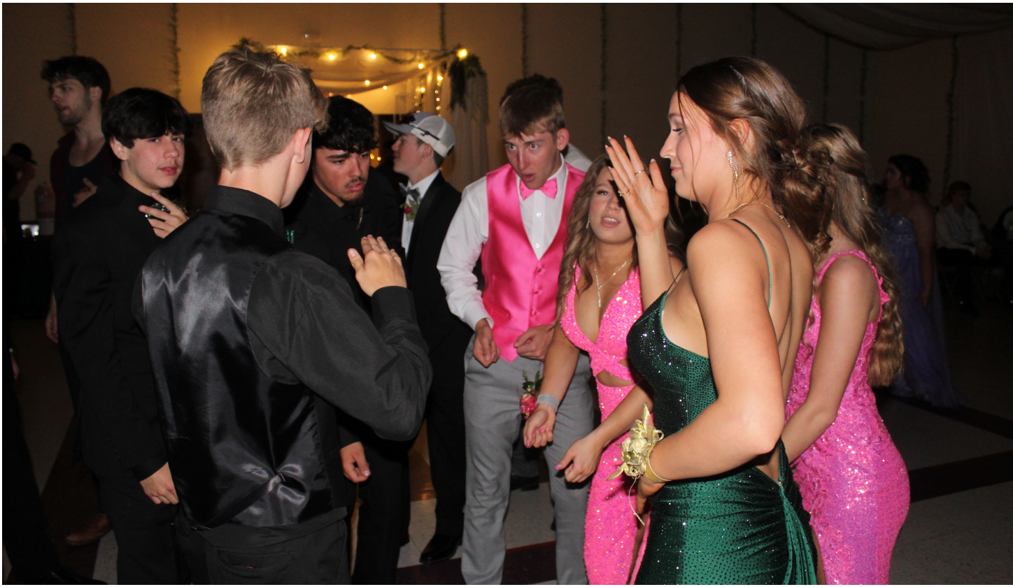
Valley Falls High School students crowd the dance floor with their dates as they dance at Prom.