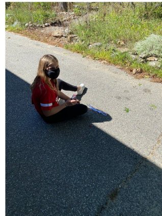
Tie dyeing a mask