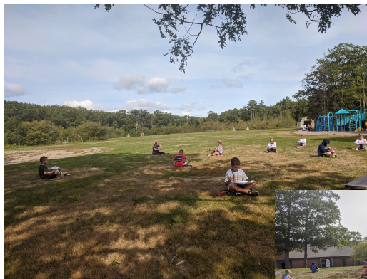
Hard at Work!