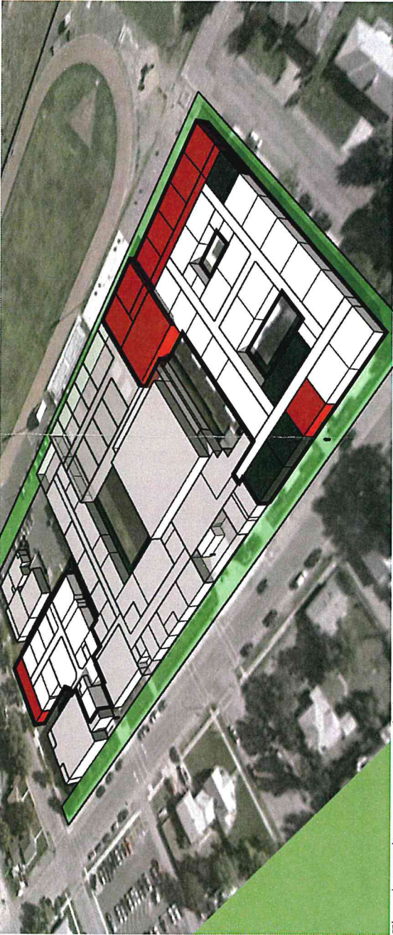
The above diagram is intended to illustrate proposed new addition, renovations & upgrades in the elementary district