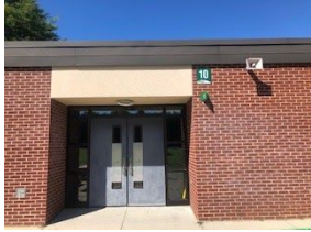
3rd and 4th Grade Door #10 Near Big Playground