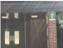
First Grade Door #2 Near Circle Drive