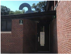
Kindergarten Door #3 Near Hoop House

anticipating many more families transporting their child and need your help to ensure your child's safety. Please park in the front/main parking lot.