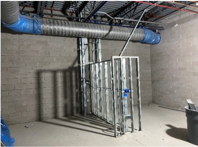
New gym overhead work (below right) New gym locker banks (below left)