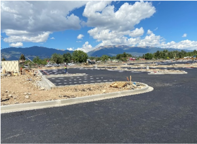
Parking lot paving nearing completion.