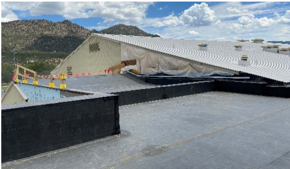
New roof tie in with existing gym completed.