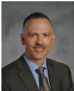
Paul J. Orlich High School Principal/Director of Instruction