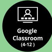
Google Classroom (4-12)