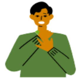
Shortness of Breath or Difficulty Breathing