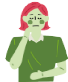
Nausea, Diarrhea, or Vomiting