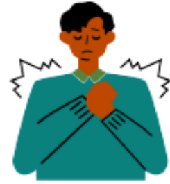
Muscle or Body Aches