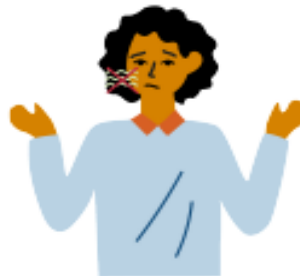
Loss of Taste or Smell