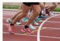
Opportunities in athletics and the fine arts