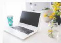
1:1 devices for ALL students K-12