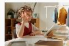
Live daily instruction both in person or