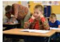
The smallest class size in the entire 7 county metro area.