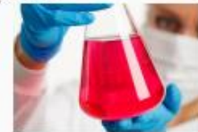
Engaging, hands-on learning throughout our schools