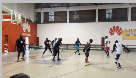
The Gym in Lusaka, Zambia