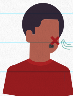
loss of taste or smell