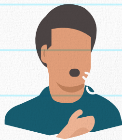
Shortness of breath or problem breathing