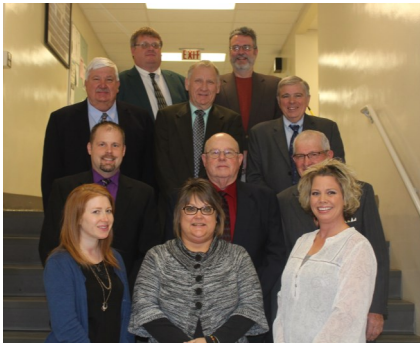
School Board Picture from 15-16 SY

It is also during the Reorganization Meetings that Board Members set dates, times, and locations for Work Session and Board Meetings for the upcoming year. The BASD School Board voted to continue the same meeting schedule as last year, with Work Sessions on the Monday one week prior to each regular business session at 6:30 PM in the Board Conference Room, and the regular Board Meeting to be held the 3rd Tuesday of each month beginning at 6:30 PM, also in the Board Conference Room.