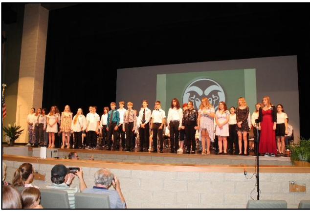
The choir singing at 8 th grade graduation.