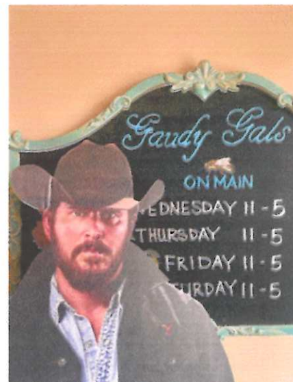
Gaudy Gals on Main

The shop will be open later on these dates