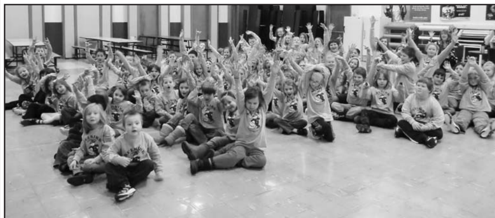
The whole school sporting their new t-shirts at the Christmas assembly

Throughout the year, students and staff practice safety drills including fire drills and lock-down. In the elementary school, the practice activities are conducted in a manner that children know they are practicing for a situation, but details are kept to a minimum. While practice is important for any potential disaster, we do so in a manner that does not stress the children. For example, in a lockdown practice scenario in kindergarten, children play the "squishy game", where they all "squish" into a small space and sit quietly. In older grades, students practice with a little more understanding but still in a manner that is not stressful. In fourth grade, they practiced "hiding" from an intruder in both hallway and exterior situations. At least one drill is practiced one time per month and varies between fire and lockdown, earthquake, or shelter-in-place scenarios.