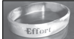
November- Effort Working hard to improve! Practice! Practice! Making the connection between effort and achievement.