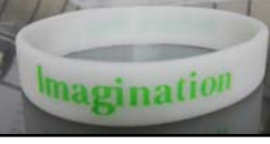
December- Imagination Thinking about the world as it could be. Finding creative solutions for problems. Using tools in creative way.