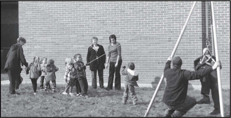
Preschoolers lifting a rescued man (dummy).