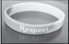
September - Respect Treating others as you wish to be treated and following school rules.

We are now using the gift certificates for a free item at Cathy's Cafe , Western Star , NuVu Theatre , or the Ione Food Court to recognize students under our new SPOTLIGHT program where students are randomly drawn (only one ticket per student). The teacher of the student then shares information about the student and the student shares what they like best about school. This is an opportunity for everyone to get to know who is in our Selkirk Elementary family and to celebrate the uniqueness of each child. A big thank you to our community sponsors who help make this STUDENT SPOTLIGHT program possible!