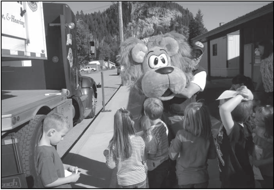
The truck driver entertaining the children waiting to be screened with the lions club mascot head.