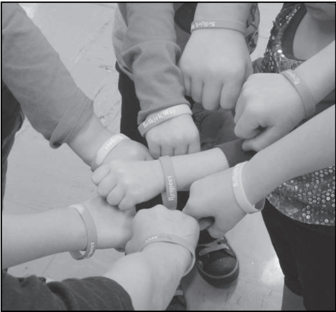
Kindergartners sporting their Selkirk Way Respect bracelets