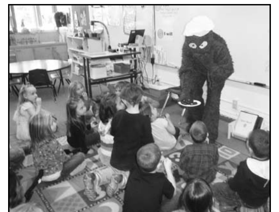
Cookie Monster passing out cookies to the Kindergarten students on Halloween.