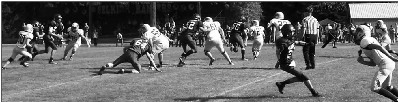
The Rangers playing against Clark Fork