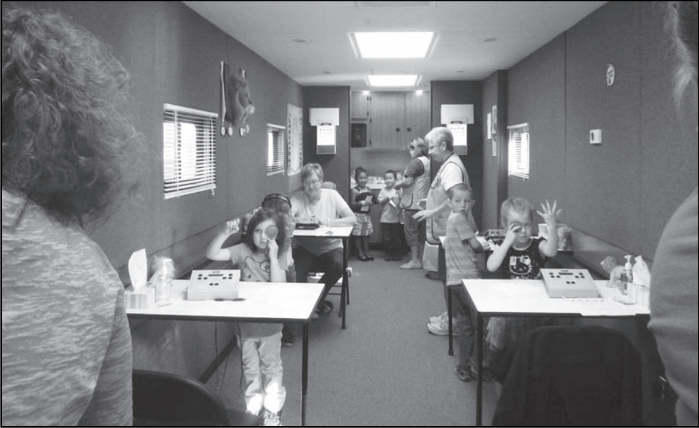
Kindergartners being tested inside the unit.