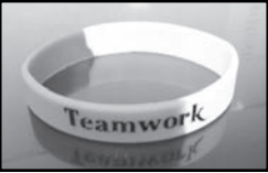
October - Teamwork . Working together and doing something to benefit everyone, not just yourself.