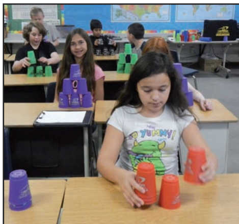
Right: 5th graders practicing in their classroom before going to the gym.

On November 12th, fifth graders organized the annual Stack-A-Thon activity in the gym. Students from grades K-4 participate in centers where they learn to stack cups and race against the clock. The activity which teaches coordination and develops motor skills (crossing the midline, gross motor, and fine motor skills) is also a Guinness Book of World Records event where student across the world participate on the same day.