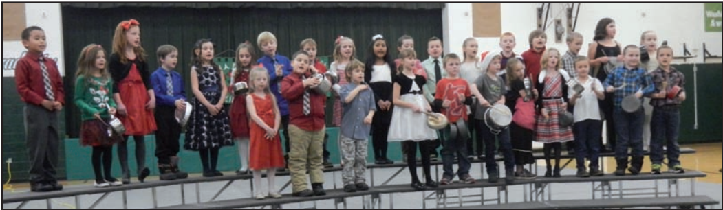
1st and 2nd Grades singing March of the Kitchen Utensils, Singing in the Kitchen, America, America, A Christmas Ally Bally, and Jingle Bells.