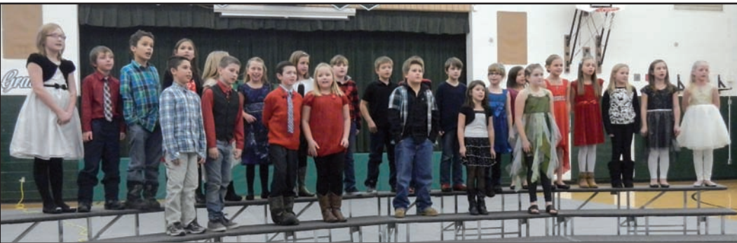
Fourth Grade singing A Christmas Motet, Christmastime and Ode to Joy