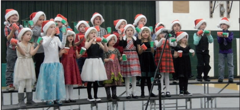
Left: Kindergartners singing Jingle Elves, Jig, Jog, Johnny the Elf Uses One Hammer, and Apple and Bananas