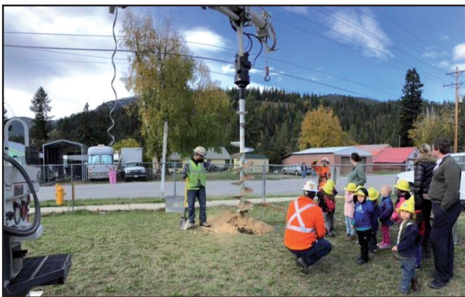
PUD employees brought a bucket truck and an auger to Selkirk Elementary and augered two holes for tree in the playground. See story on page 1.

Paul Kiss, Brandon Corkill, Tanner Williams and JL Chantry from PUD demonstrated their bucket truck and digger truck to the preschool and kindergarten students on October 9th. They used the digger truck to auger two holes in the corner of the playground to plant trees. They also set up their Power Town in the gym and showed the Lightning Bug video in each classroom.