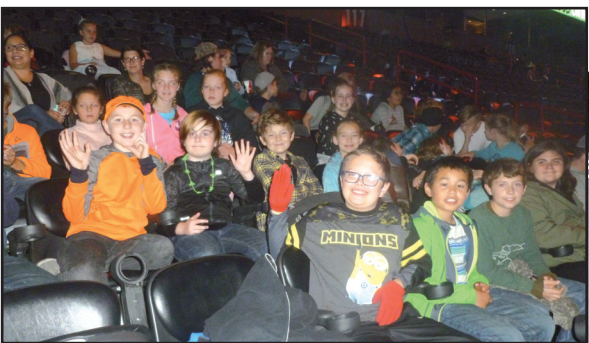
Top: 5th grade students at the Spokane Arena awaiting Disney on Ice paid for by the Selkirk Humanities Foundation (see article on page 7).