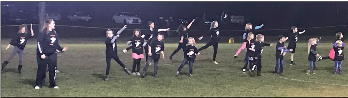
Little Kid Cheer Camp performance during halftime at the football game October 22nd.

The Selkirk Cheerleaders held a Little Kid Cheer Camp for elementary students the week of October 22nd. The students practiced every day after school learning a cheer routine which they performed during halftime of the football game against Curlew. The Cheer Squad also circulated flamingos during October to support Breast Cancer Awareness.