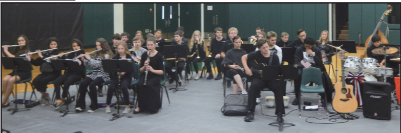
Right: Selkirk Concert Band