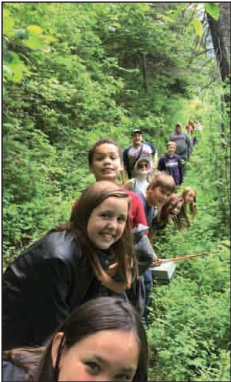
Above: Fourth graders Hiking the Elk Creek trail.

Mill Pond & Elk Creek Trail for 4th-6th grades The Forest Service planned and paid for transportation for a field trip to the Mill Pond on June 2nd. USFS coordinated with the Seattle City Light, PUD, POC Weed Board and the Kalispel Tribe to teach 4th, 5th & 6th grades students about the Mill Pond and its environment so they can track the changes that will be taking place in the next couple of years. There were stations set up for the students to learn about fish tracking and shocking, microinvertebrates, noxious weeds and a stream table. Students also spent a little time fishing, touring the historical site and hiking the Elk Creek Trail. Thank you to all the agencies involved!