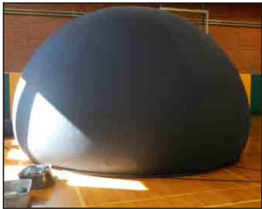
Above: Inflatable planetarium.

Pictured right: Space Odyssey instructor showing students what would happen to a body in space (balloon) without the protection of a spacesuit at the assembly.