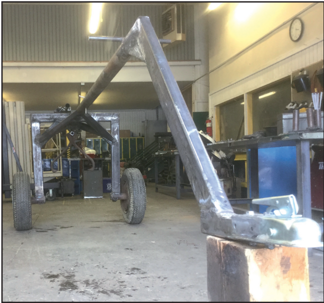
Above: Log Hauler being built by the Metal Shop students with repurposed metal.