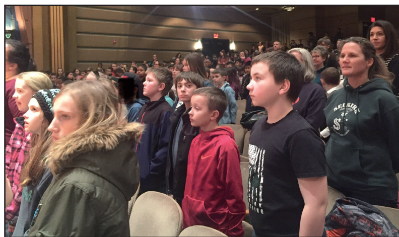
The 4th grade enjoying a performance of the Spokane Symphony at the Fox Theatre.

We learned a lot about music, art, culture and science. We had so much fun! My favorite part was the Mobius Science Center because it was really entertaining and just straight out fun. I also liked the Davenport Hotel because it was really fancy and cool, I felt like I was in the Titanic.