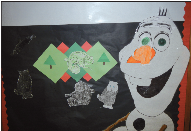
Can you find all the camouflage animals on this hallway bulletin board? Hint: there are 8.