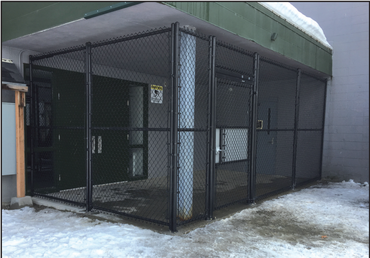
Above: North entry security gate at high school

The school district contracted with Moran Fencing out of Spokane for a few safety updates. Two new traffic gates were install at the elementary school to better delineate a closed roadway during the school day. At the high school, the back entry was enclosed for security purposes and while the gateway provides a push bar for egress, the entry side will be locked during school hours. All visitors should enter through the main bulding door.