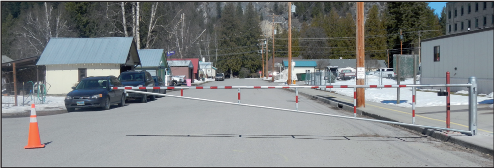
Right: Road closure gates across Park St. at Selkirk Elementary during school hours.