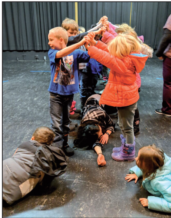
K-1st grade students in the Drama Quest workshop.

Even though MCT is not a school sponsored event, as part of their residency the MCT allows the school to choose three 45 minute workshops out of a list that each class participates in. This year 2nd, 3rd, and 4th took the Improv workshop in which participation and teamwork were emphasized as the students learned to act without a script. 2nd, 4th, and 5th grades and later Kindergarten and 1st participated in the Drama Quest workshop which was a “grand adventure through a jungle”. Using active role-playing in a dynamic group setting, students developed problem-solving skills by using their communication and imagination skills. Both pictures were from the K-1st Drama Quest workshop.