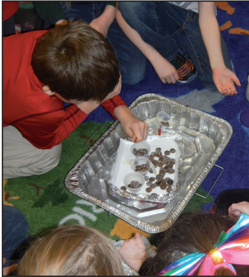
Will this ship hold another person (penny) without sinking?