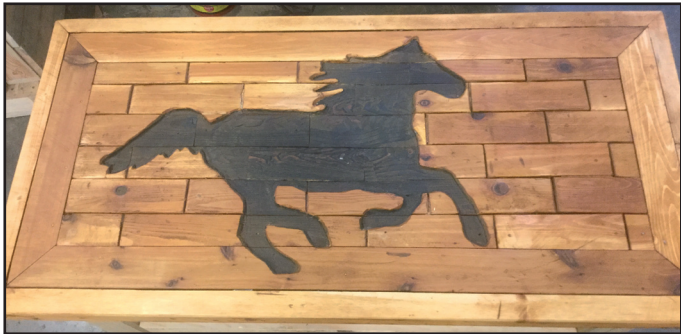
Top Left: three coffee tables built by students Middle: Jay Link with his sofa table. Bottom Left: coffee table built by a 6th grader with an added design Bottom Right: coffee table top built with lumber pieces that were stained in different ways: traditional stain, colored with watered down paint, and a mixture created by soaking steel wool in vinegar. The individual pieces where routed around all edges before being assembled.