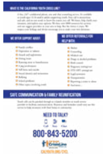
4x5 Info Flyers (front/back) *also available in spanish*