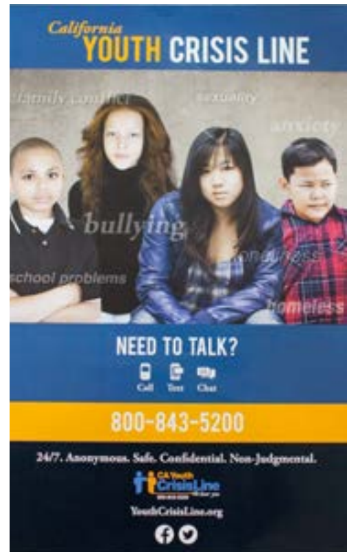
11x17 Crisis Line Posters