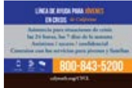
3x4 Calling Cards (front/back)