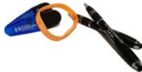
Magnetic Chip Clips Wristbands Stylus Pens