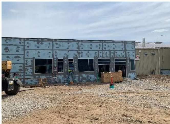
Window cut outs at the HS Gym Tie-In (Left)