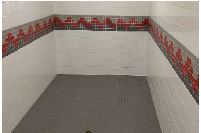
New tile in the locker rooms is complete (Right)