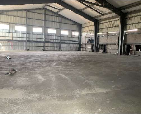
The Middle School Gym slab has been poured. (Left)