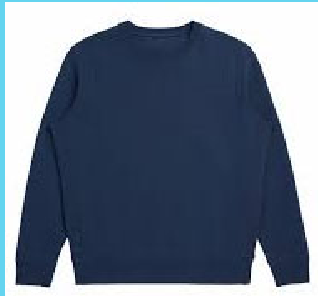
Solid navy sweatshirt