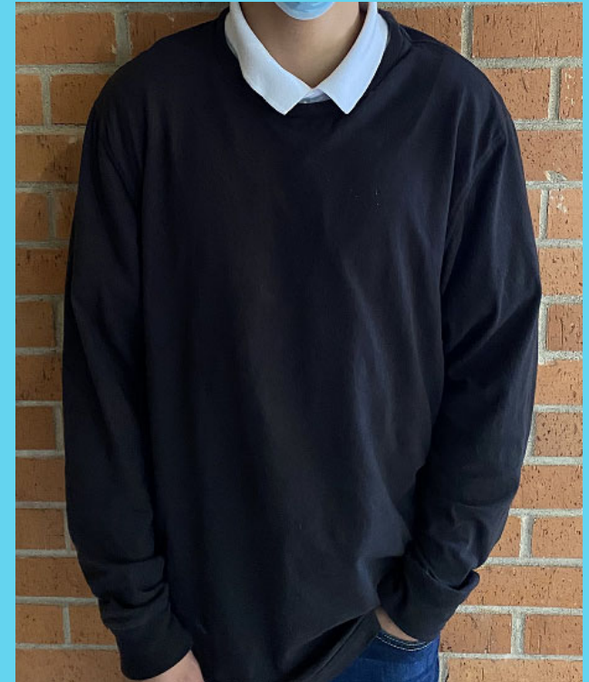
Solid black sweatshirt