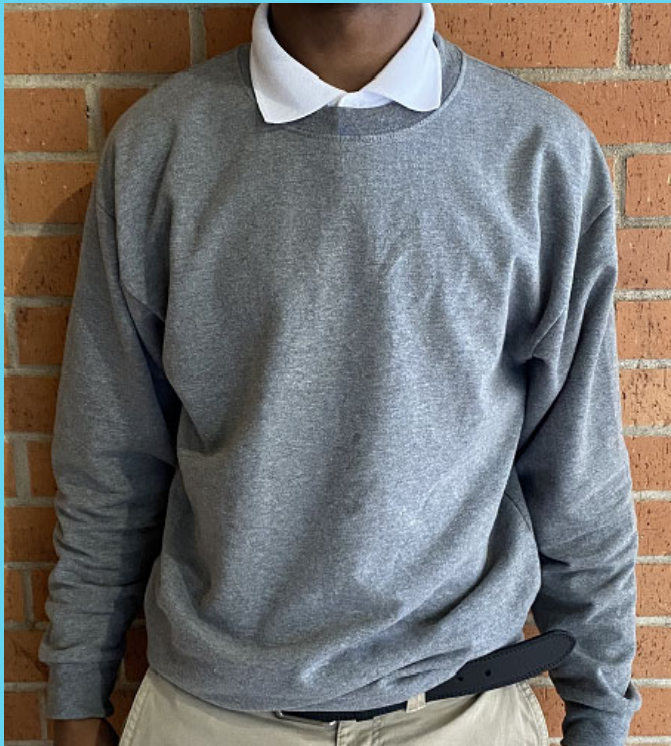
Solid grey sweatshirt

From Halloween until Easter, students may also wear a solid black, navy or grey plain sweatshirt due to possible cold weather. We will announce when this is allowed through ClassDojo. (No hoodies, zippers, pockets, ties or buttons allowed)