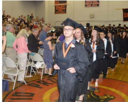
Graduates celebrate their accomplishments on the way out of the gymnasium.