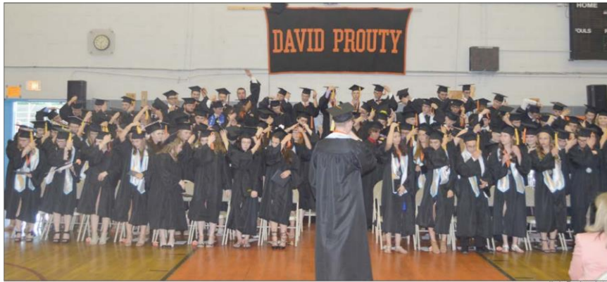
The Class of 2017 turns their tassels.