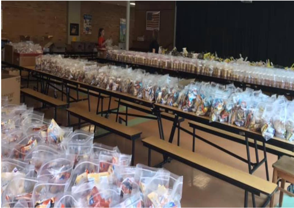
LET'S THANK OUR FOOD SERVICE DEPARTMENT AGAIN FOR THEIR EXCELLENCE DURING REMOTE LEARNING!