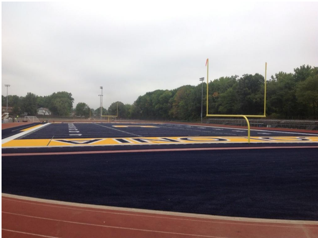
CHS Football/Soccer Field