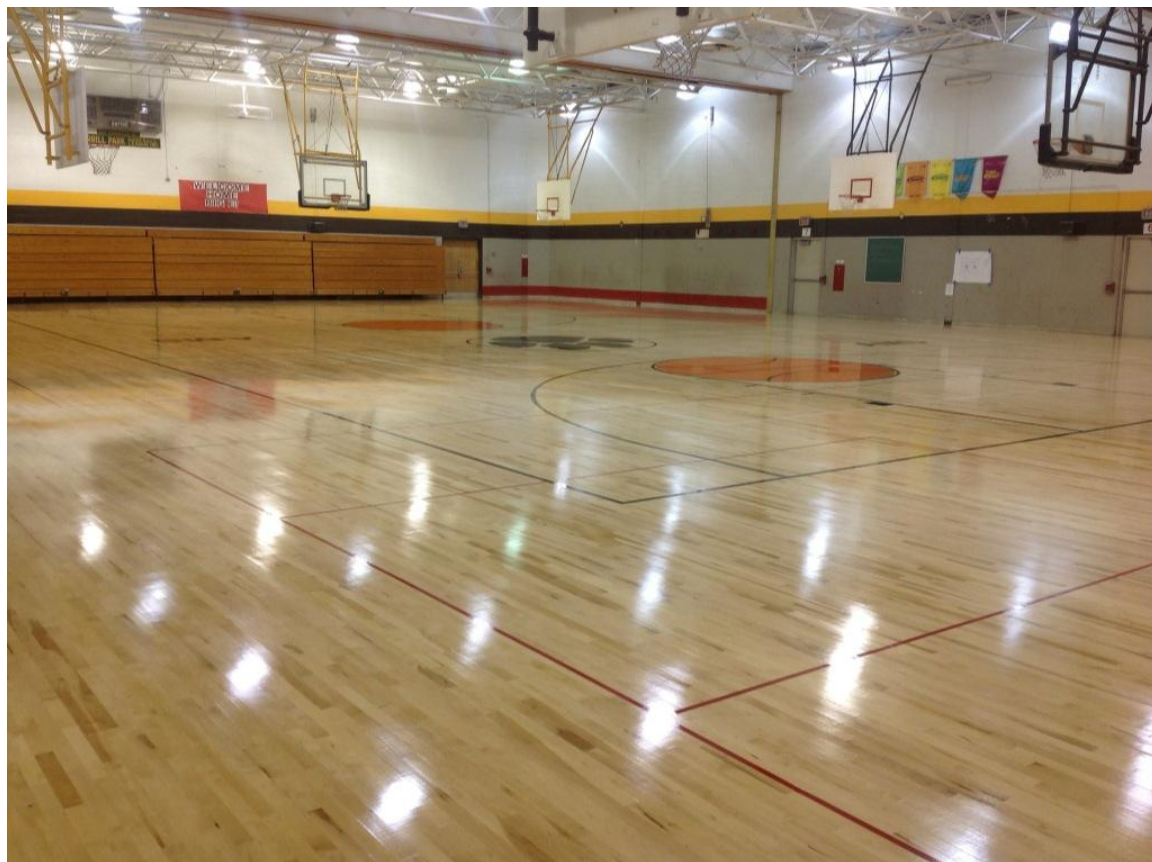
AMS Gym Floor

Coming together is a beginning; Keeping together is progress; Working together is success.