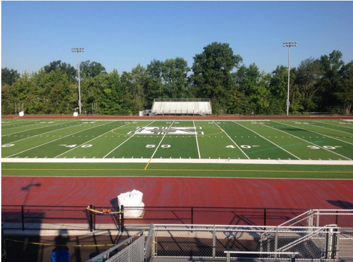
JFK HS Football/Soccer Field