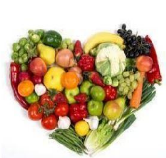
Increase Fruit and Vegetable Education