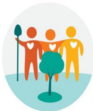
Build Strong Connection with Community, Peers, and Land