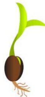
Teach Children How to Grow Food Through Garden Techniques