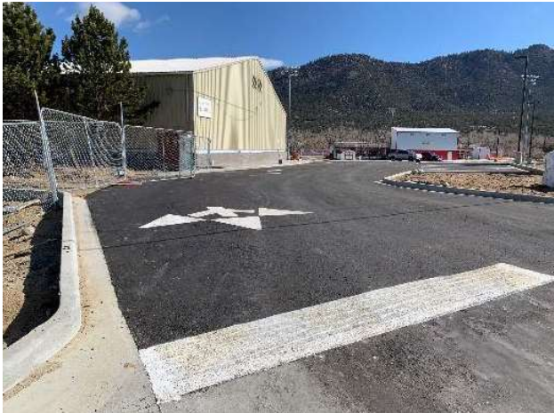
Southeast Parking Lot