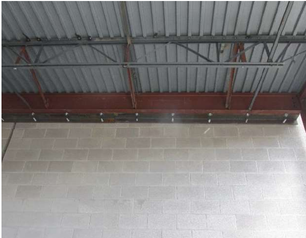
Steel and Masonry Block