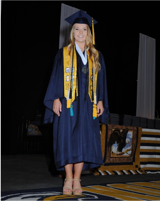
Full length holding diploma (diploma not pictured)