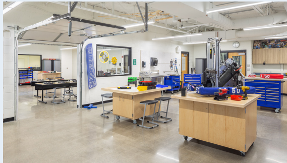
Career Technical Education (CTE) classroom addition, including a dedicated robotics space

Above is an example of typical afternoon pick-up traffic at both buildings.