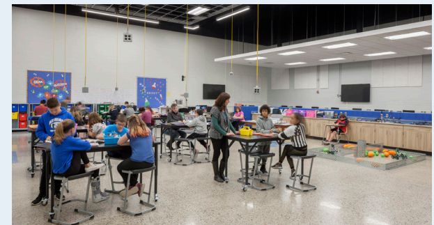
Remodeling at the Middle School create science classrooms and dedicated science lab

Photos for demonstration purposes only; final product will be a collaborative effort between the design team and Lake Fenton