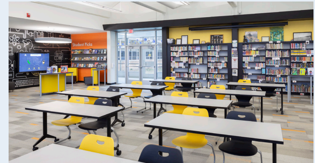
Media Center remodel with mobile furniture, a variety of reading and quiet study spaces, and instructional tech