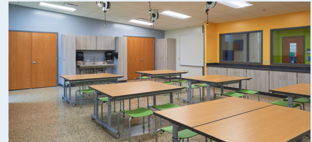
Remodeling at Torrey Hill to create a new STEM classroom