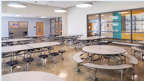
Remodeling to create a new cafeteria space at both Torrey Hill and West Shore Elementary