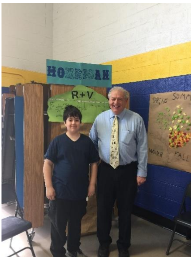
My tour guide at Project Sweet Talk

Bernard of FCMTBC remarked that it was an encouraging sign to have students acting as stewards of the community's recreational trail system. Pictures of the work shown below.