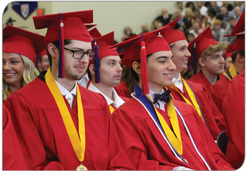
Class of 2022 graduates react during their student leaders' remarks at commencement.

These students worked tirelessly for the last four years, all while enduring a global pandemic that shifted, affected, and changed their high school experience. They maintained their dedication and focus, which is a