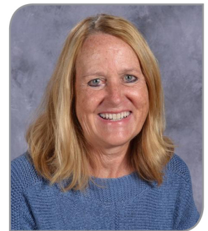
Beth Underwood Van Buren Elementary