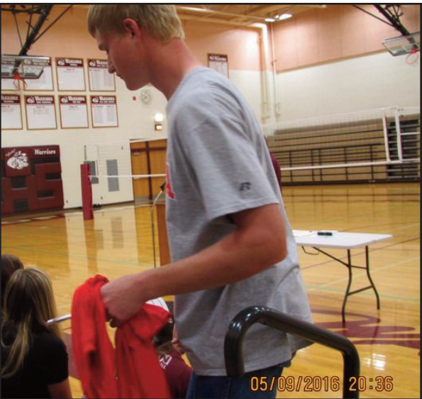
Students enjoyed and congratulated during the awards assembly