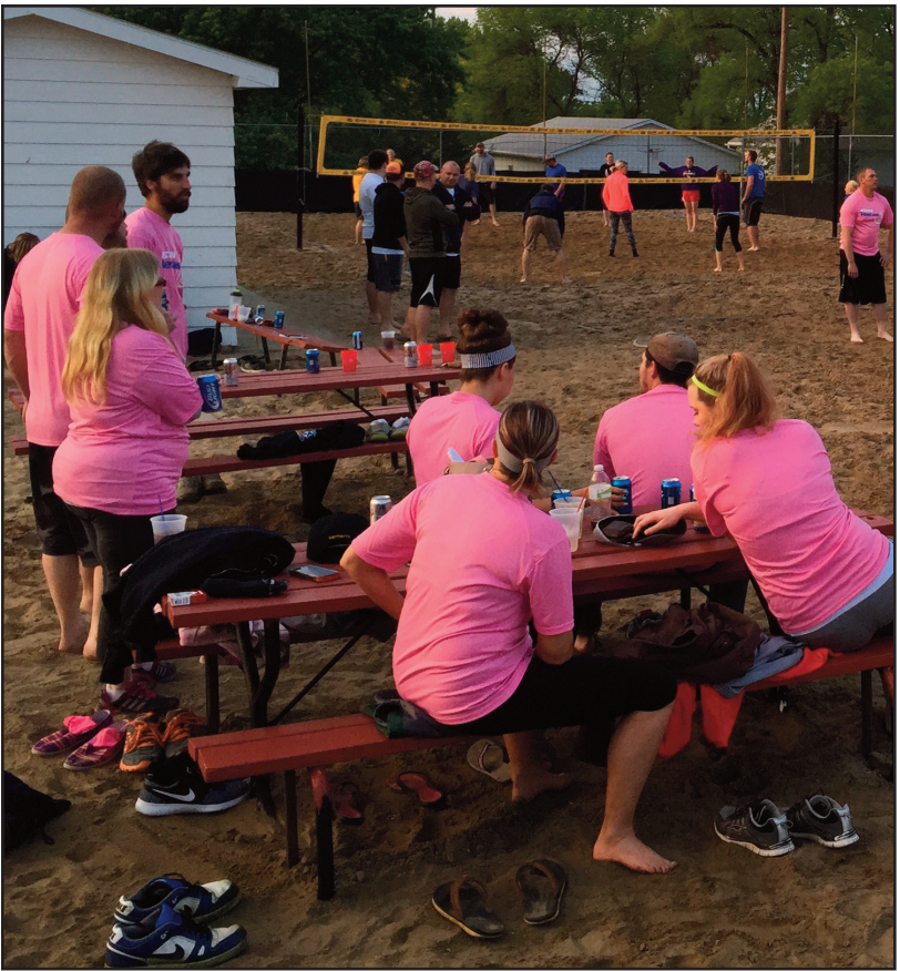
Sand Volleyball continues at Wiebelhaus Recreation sand volleyball courts.