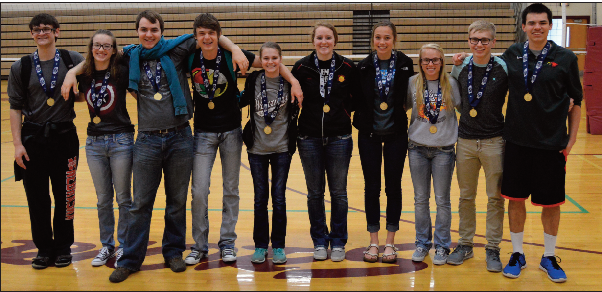
Speech team received their first place State Medals during the awards ceremony that was held at the end of the year.