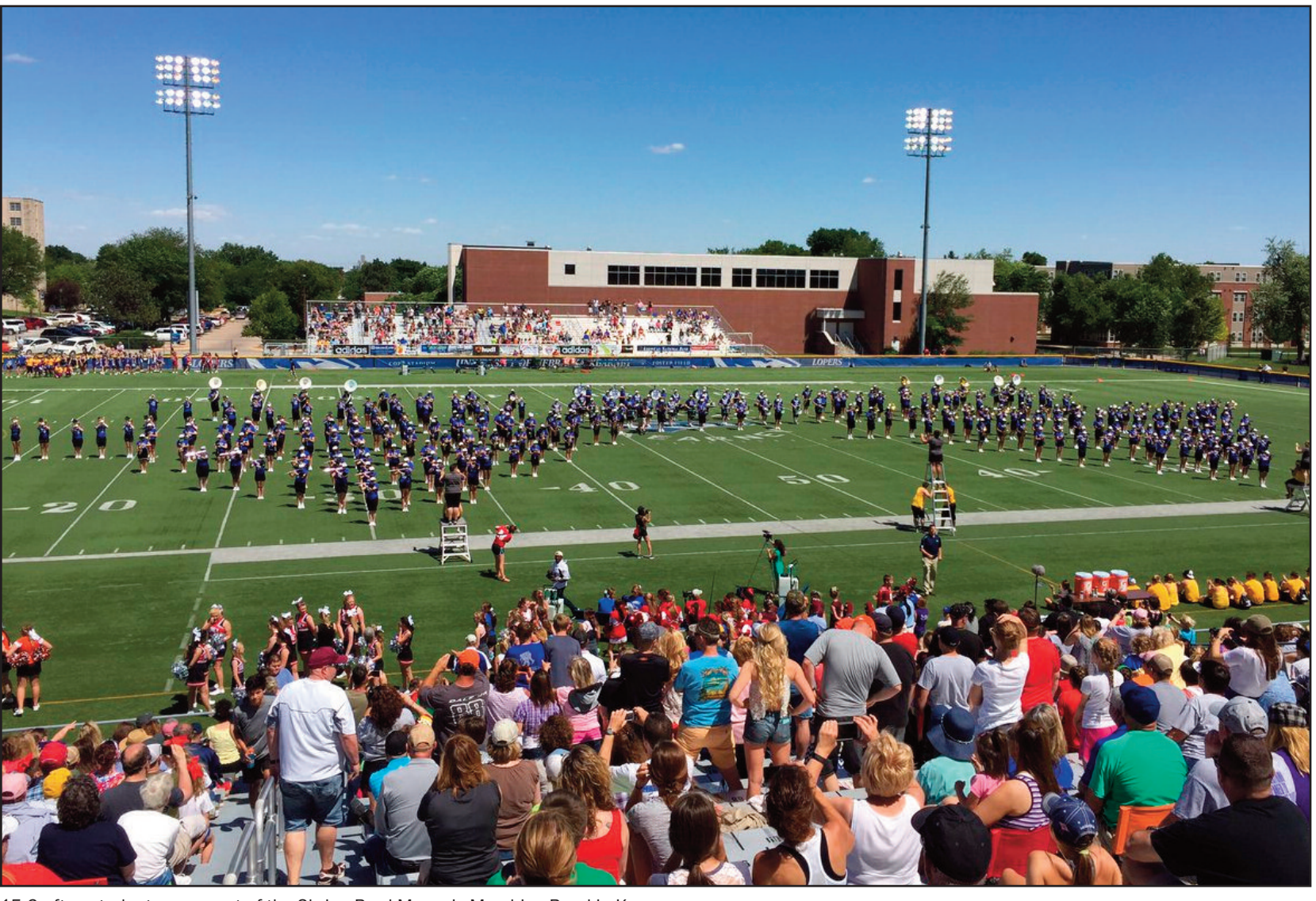
15 Crofton students were part of the Shrine Bowl Masonic Marching Band in Kearney.