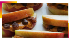
Recipe courtesy of URI SNAP-Ed