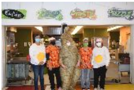
Food Service Staff