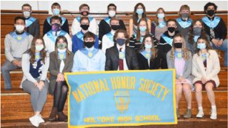
2021 National Honor Society Members