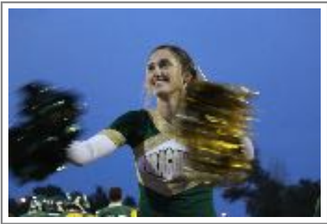
Cheerleader in 2019