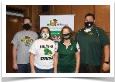
District Office Staff

tions for fishing, boating and waterskiing.