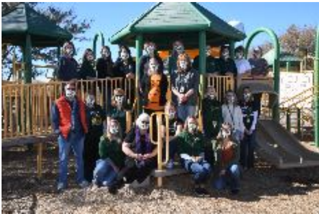
Elementary Staff

AOC is provided for all 5th and 6th grade students in the Elementary School.