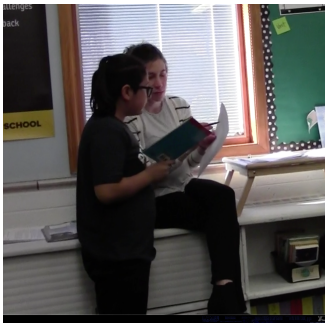
6th Grade teacher and students in 2019

earned a a grade lower than 70% on an assignment or assessment will be required to attend the AOC. Students will have the opportunity to complete missing work or to work on corrections during that time. This is a positive environment focused on achievement, not a punitive detention. Students can count on a positive and productive environment