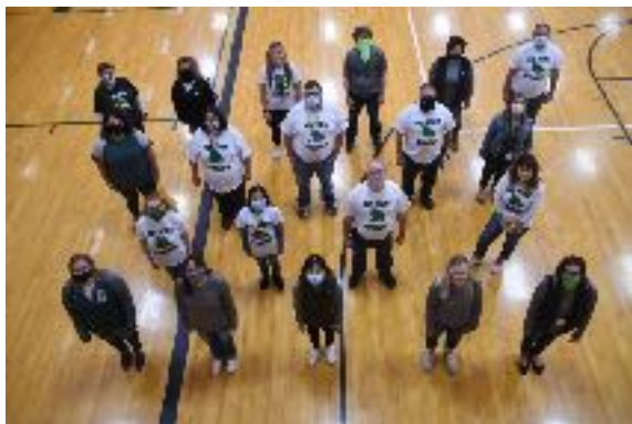
2020-2021 JR/SR High Staff

70%. The AOC is held Monday - Thursday from 3:45 to 5:00 after school. Any student who comes to class without an assignment completed the day and/or earned a grade lower than 70% on an assignment or assessment will be required to attend the AOC. Students will have the opportunity to complete missing work or to work on corrections during that time. This is a positive environment focused on achievement, not a punitive detention. However, failure to attend results in negative consequences (including students not being allowed to attend athletic events until their school work is done). Students can count on a positive and productive work environment where the focus is on being successful.