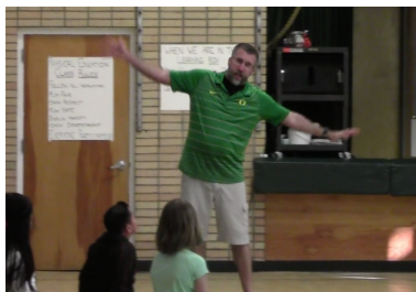
Elementary P.E. Class in 2019

where the focus is on being successful. During this time, a designated teacher will spend time working with students on completing the missing assignments. Teachers will also provide