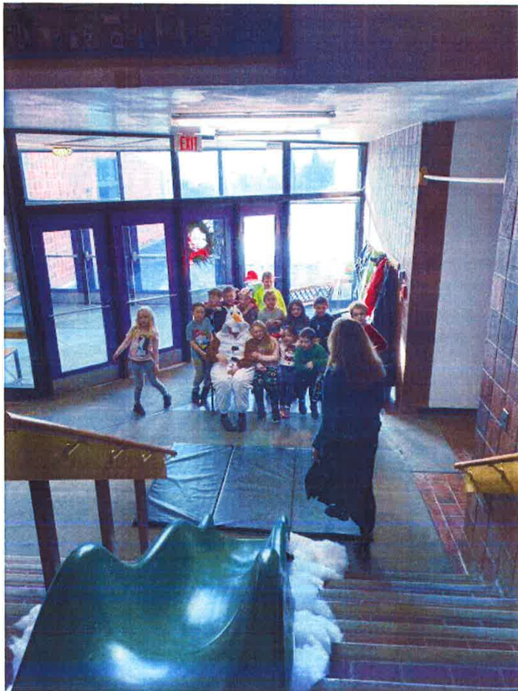
Fun Day in Arendelle