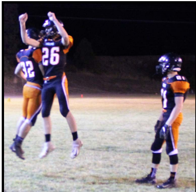
The Republic Tigers won over Wellpinit by 58-16!