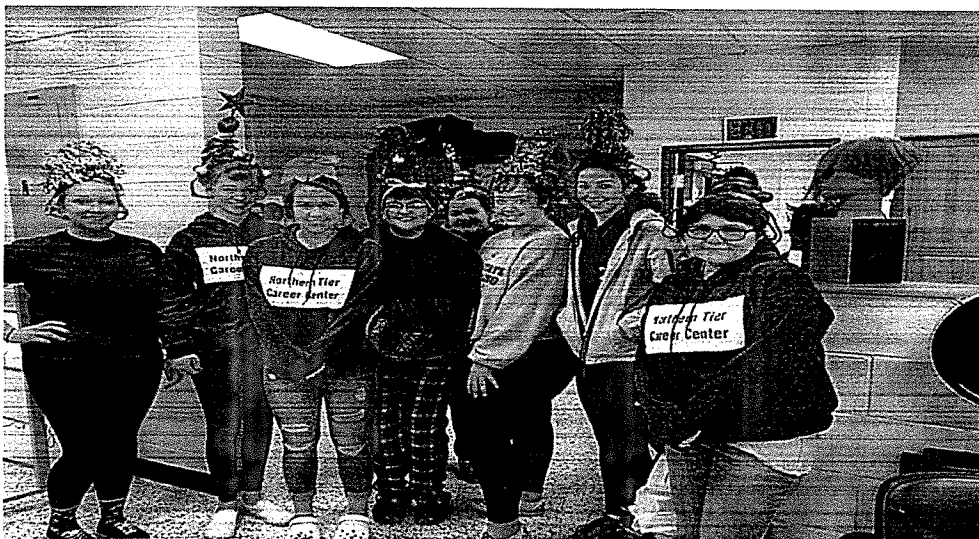
Cosmetology Students Christmas Up-Do's