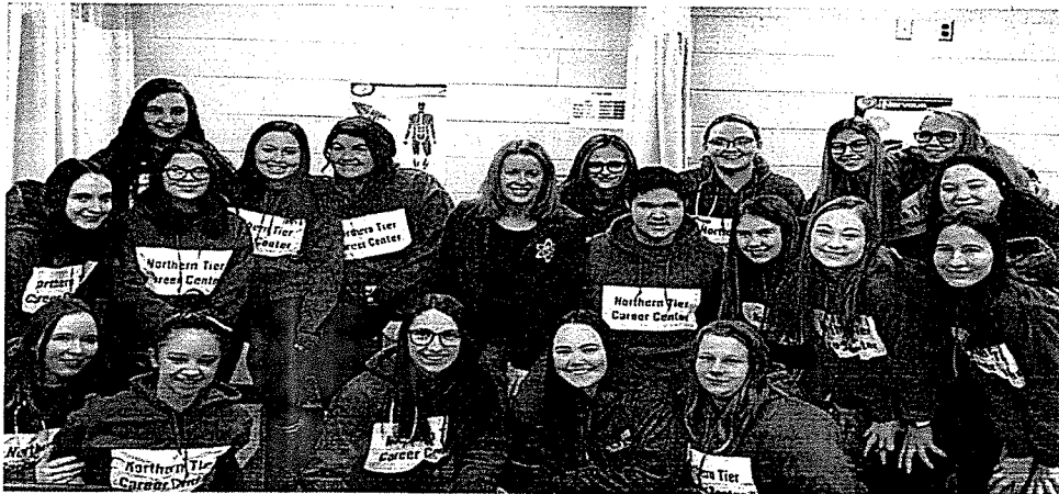
School Store Purchases Program Sweatshirts